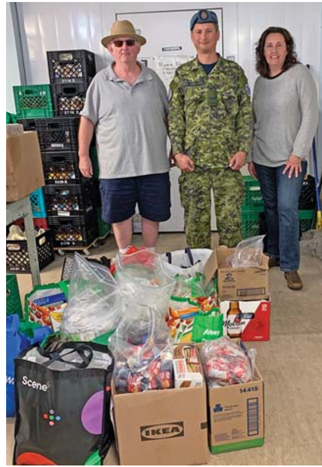
Some October Combined Charities' success: 330 pounds of food donated to the Upper Room Food Bank, 560 pairs of new socks donated to Open Arms in Kentville, and 39 Gift Card Survivors are on the "island," hoping to win the October 31 finale draw.

December The wing's Festival of Trees is Combined Charities'