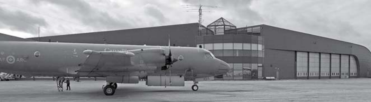
On of the Royal Canadian Air Force’s CP140 Aurora aircraft, based at 14 Wing Greenwood, visited the Canadian Warplane Heritage Museum in Hamilton. Ontario, December 7. A crew from 404 (Long Range Patrol and Training) Squadron was in the area conducting high density pilot training.

The mission represents approximately 7,500 hours flown and nearly 6,000 points of interest observed.