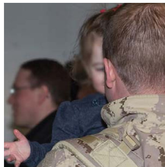
Corporal D. Salisbury, 14 Wing Imaging