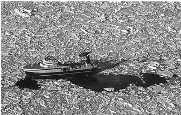
The top cover view from a 413 (Transport and Rescue) Squadron Hercules search and rescue aircraft, as a Cormorant from 103 Squadron conducts a medevac April 3 from the Northern Osprey, a fishing vessel off the coast of Labrador.

April 3, the Greenwood aircraft was re-tasked on another top cover mission east of St. John's. A man was reported injured after a fall on board a fishing vessel to the east. With the top cover requirement complete after a successful medevac, the Hercules returned to Greenwood just after 5 a.m. April 4.