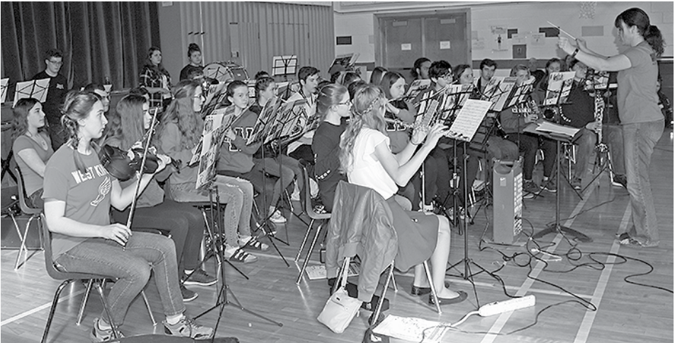
April 25, West Kings' concert band and drum line took a mini-road trip, visiting Dwight Ross and Kingston school students to present just some of the music they'll be taking on tour May 15 to 20, as they head out to New York.