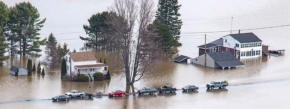
14 Wing Imaging’s Corporal Trevor Matheson shot this overhead view of New Brunswick flooding through the Saint John River valley May 4, while on a training flight with 413 (Transport and Rescue) Squadron

For all inquiries, contact the WPSO, Lieutenant Ngo, lyly.ngo@forces.gc.ca