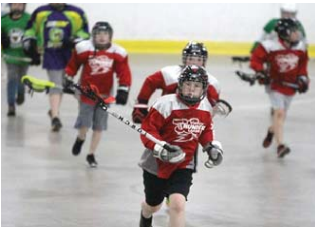
Valley Thunder Lacrosse's Peewee team, in red, made their debut in the Nova Scotia non-Metro league May 5, with a 1-1 record on the road in Trenton. The team took a loss from Pictou, but came back for a win against Cape Breton.

Making their debut in a Nova Scotia Peewee league