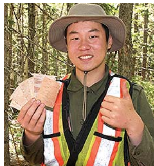
A tree bark playing card camp craft.

Back at the lake, I noticed the Survival Instructor Course (SIC) Cadets were making fires on the beach. I found out this was part of their training, and they were being evaluated. Now, I have a hard time making a fire with a lighter and a fire log but, some-