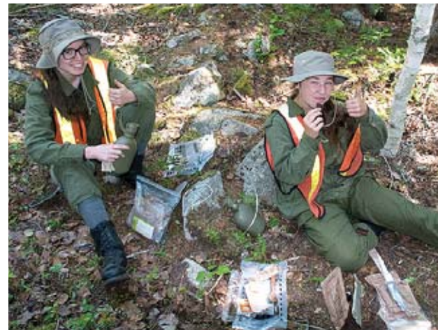
BSC Alpha Cadets enjoy some M.R.E.s.

staff Cadet trailer for me and, indeed, there was. As soon as I lay down, I slept like a rock after such a long day in the woods.