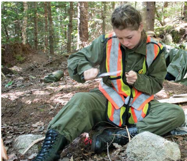
A Basic Survival Course Cadet sharpens the end of a stick for her shelter.

When I had taken all the pictures I needed, I headed to the safety site, where all the staff works. While I was waiting for my ride back to the lake, I decide to try one of the MREs. Pre-packaged food meant to last for years sounds like it would be absolutely terrible; it was actually delicious. I had a pork patty on bread with blackberry jam, a cracker, Gatorade and an energy bar. Not bad for a meal in the woods during a "survival situation."