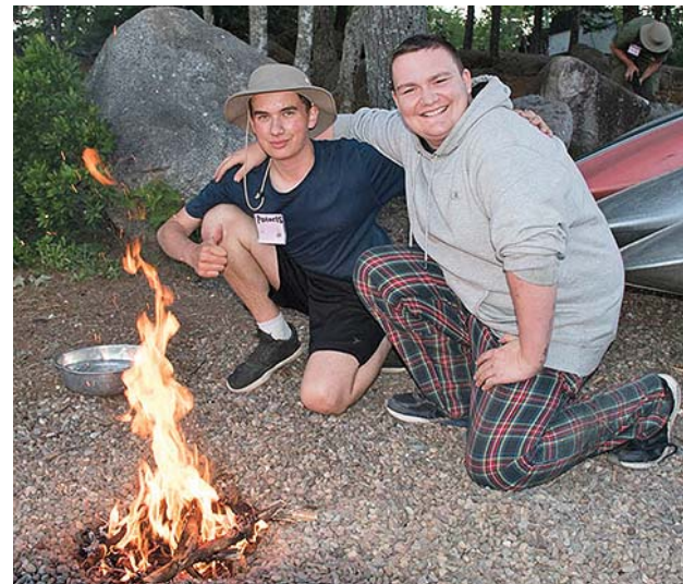
Survival Instructor Course Cadets practice their fire building techniques.

All the fires were put out and it was just about time for bed. All the Cadets headed to their tents. These aren't regular camping tents. They are long green tents with room for 12 cots. At this point, I asked if there was an empty bed in the