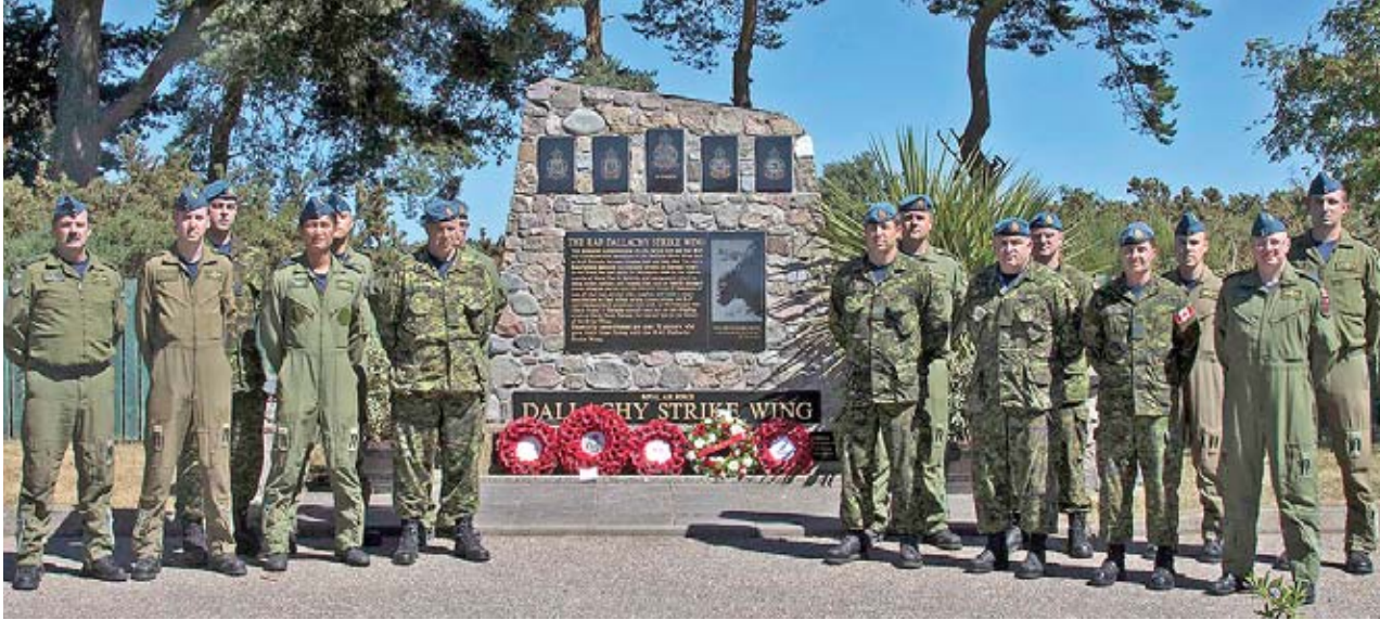
Several Royal Canadian Air Force squadrons, including 404 (Long Range Patrol and Training), 405 (Long Range Patrol) and 14 Operations Support squadrons, participated in a memorial service July 1 at Dallachy Memorial, commemorating “Black Friday” February 9, 1945.

Dallachy airfield (also known as RAF Dallachy) is located to the east of Elgin, near the town of Fochabers. The airfield was built during the early 1940s and opened in March 1943. From September 1943, it became an operation-