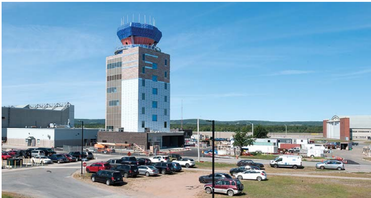
There won't be a fall opening of 14 Wing Greenwood's new $14 million, nine-story air traffic control tower; the scale of the project and the equipment being installed will push completion into late winter 2019.