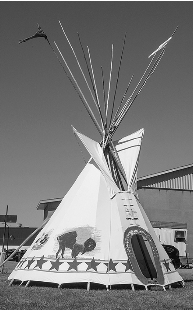
The 14 Wing Greenwood Defence Aboriginal Advisory Group set up a colourful cultural display at Wing Welcome’s September 8 events.

and CAF members could be denied entry to these countries as a result of cannabis consumption or involvement in the legal cannabis industry in Canada. CAF members are responsible for obtaining information about the cannabis consumption and possession laws and policies of any country they intend to visit. Defence team members are encouraged to visit the “Cannabis: What you need to know” Intranet page to get updates on the DND/CAF policies, while additional information can be found on the Government of Canada’s cannabis webpage.