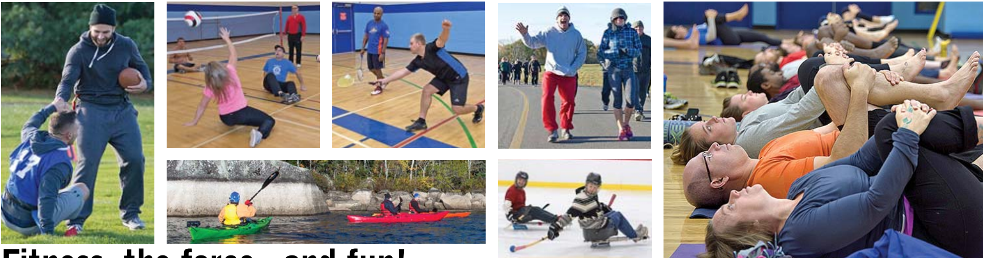
Fitness, the force - and fun! 14 Wing Greenwood personnel took to the field, the ice, the water, the road and the courts October 19, participating in a variety of activities as part of Canadian Armed Forces National Sports Day. Sporting their favourite jerseys, many turned out for a group picture and social to wrap the day's sporting fun.