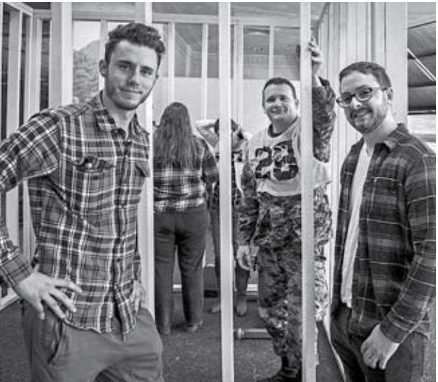
Corporal A. Chand, 14 Wing Imaging