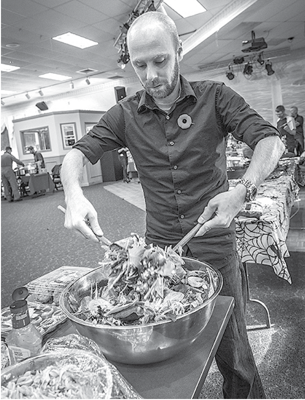
Corporal A. Chand, 14 Wing Imaging